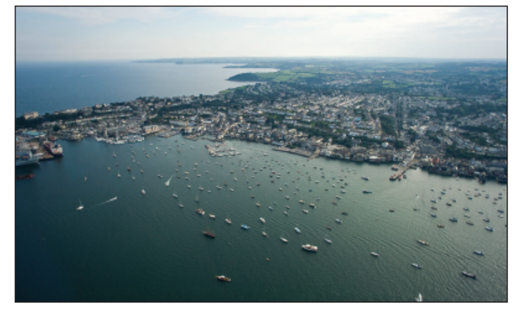
Looking south-west from the Flushing side of the Penryn River over Falmouth.