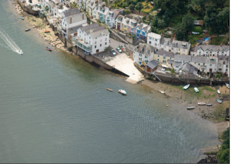
Above the slipway looking into Passage Street, Fowey.